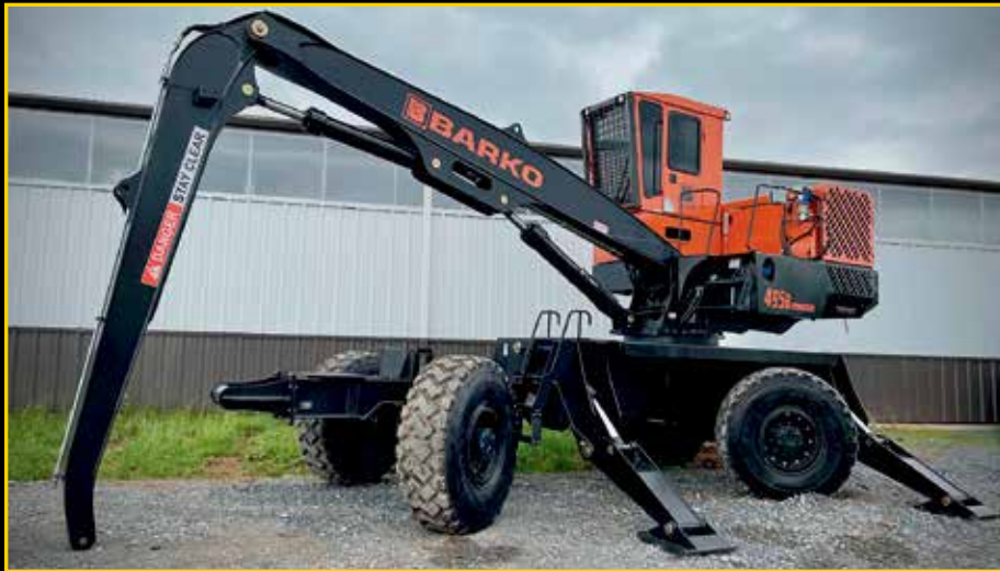
NEW BARKO 495RTC IN STOCK! THE ULTIMATE MILL YARD LOADER

We continue to offer quality used parts for all makes