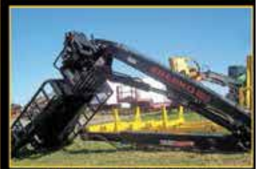
2024 Barko 80XLE IN-STOCK