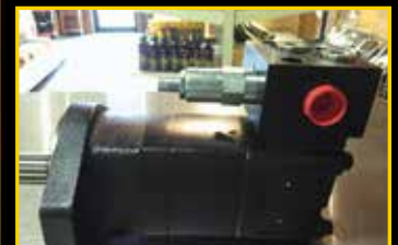
Grapple Rotate motors for Deere Skidders Series G thru H

Direct Fit no adaptors or fittings needed Proven Design, sold over 1200 Units Unlike OEM Pump, this is completely rebuildable. The parts are available at most hydraulic distributors