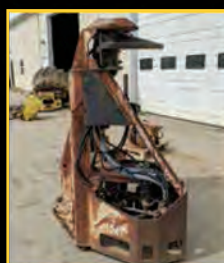
Timbco Bar Saw Head for Wheeled Machines $4000

OUR MOTTO IS SIMPLE: Treat Others Like We Would Want To Be Treated