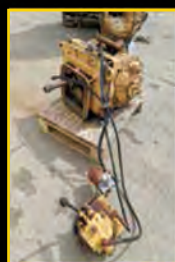
Cargo C12 Winch for Case 310 Dozer, $2,500

BARKO: 160A, 160B, 160D, 275B, 350. CAT: 508, 515, 518, 525, 525B, 525C, 545, 711. CASE: 300C. CLARK: G67, 665D, 666D. FABTEK: 153. FRANKLIN: 100, 105, 130, 132, 142, 160B, 170, 405, 462, Q80. HUSKY: 335. HYDRO-AX: 221, 411, 611E, 711E. IH: S7, S8. SKIDMASTER: SK80. JD: 435, 437C, 440A, 440B, 440C, 540A, 540B, 548D, 548E, 548G, 548GII, 634K, 640, 643D, 648D, 640E, 648E, 648G, 648GII, 648GIII, 648H, 653E, 748E, 748G, 748H, 753J, 843K, 848G. PEERLESS: 2170. PRENTICE: 120, 150, 180, 210B, 210C, 210E, 280, 310E, 325, 384, 410D. TJ: 208, 230, 230D, 240, 240D, 240A, 330, 380, 450, 360, 460, 560, 660, 660D, 608S, 850, 1270 Harvester. TIGERCAT: 610, 630B. TIMBERKING: 540, 722. TIMBERPRO: 725B. TIMBCO: 2518, 425B, 425C, 425D, T435, 445D, 425EXL Bar Saw Head. TREEFARMER: C4, C5C, C5D, C6C, C6D, C7D, C7F. Bell Ultra T & Bell Super T. MORBARK Wolverine: Rolly Processing Head: TJ 762B Head.