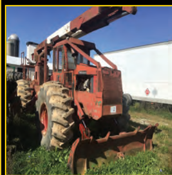
(2) 1997 & 1998 TJ 240C Bucket/Sprayer machines. Never pulled wood. $25,000-$35,000