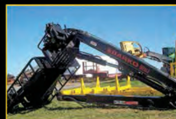
2022 Barko 80XLE IN-STOCK

Ph: 717-400-7062 • Fax: 717-933-4022 Myerstown, PA • Goldenruleequipment.net