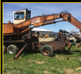
Barko 275B on Self-propelled carrier Very well maintained Cummins $29,500