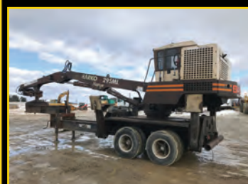
06 Barko 295 Cummins, Rotobec, New Hyd Collector $49,500