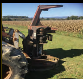
Koehring Hotsaw off wheel cutter Good condition $5500