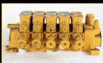
New Surplus Control Valves for Deere 653E/G Fellerbunchers $4,900 ea. Some individual Sections Available