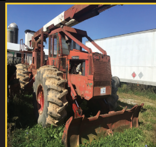
(2) 1997 & 1998 TJ 240C Bucket/Sprayer machines. Never pulled wood. $25,000-$35,000