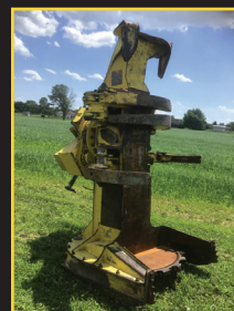
Deere FR21B head off 753J 360 Rotation