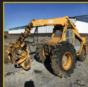
Bell Ultra T Rebuilt Deutz, Joysticks, 23.1 Tires $25,000