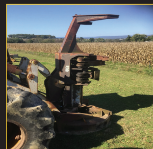
Koehring Hotsaw off wheel cutter Good condition $5500