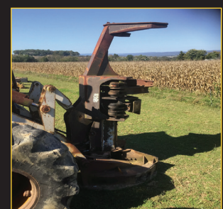
Koehring Hotsaw off wheel cutter Good condition $5500

Bell Ultra T Rebuilt Deutz, Joysticks, 23.1 Tires $25,000