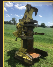
Deere FR21B head off 753J 360 Rotation

(2) 1997 & 1998 TJ 240C Bucket/Sprayer machines. Never pulled wood. $25,000-$35,000