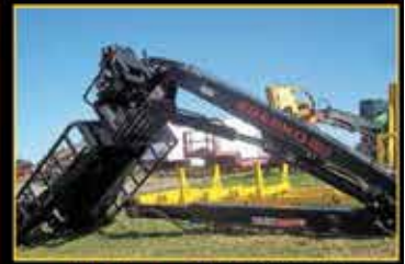
2022 Barko 80XLE IN-STOCK

Ph: 717-400-7062 • Fax: 717-933-4022 Myerstown, PA • Goldenruleequipment.net