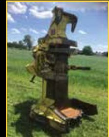
Deere FR21B head off 753J 360 Rotation