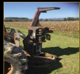
Koehring Hotsaw off wheel cutter Good condition $5500