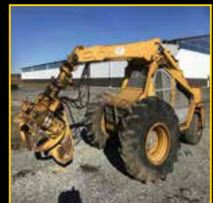
Bell Ultra T Rebuilt Deutz, Joysticks, 23.1 Tires $25,000