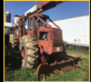
(2) 1997 & 1998 TJ 240C Bucket/Sprayer machines. Never pulled wood. $25,000-$35,000