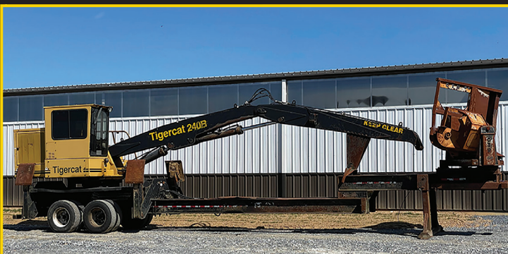
2004 Tigercat 240B Strong tight machine $35,000

BARKO: 160A, 160B, 160D, 275B, 350. CAT: 508, 515, 518, 525, 525B, 525C, 545, 711. CASE: 300C. CLARK: G67, 665D, 666D. FABTEK: 153. FRANKLIN: 100, 105, 130, 132, 142, 160B, 170, 405, 462, Q80. HUSKY: 335. HYDRO-AX: 221, 411, 611E, 711E. IH: S7, S8. SKIDMASTER: SK80. JD: 435, 437C, 440A, 440B, 440C, 540A, 540B, 548D, 548E, 548G, 548GII, 634K, 640, 643D, 648D, 640E, 648E, 648G, 648GII, 648GIII, 648H, 653E, 748E, 748G, 748H, 753J, 843K, 848G. PEERLESS: 2170. PRENTICE: 120, 150, 180, 210B, 210C, 210E, 280, 310E, 325, 384, 410D. TJ: 208, 230, 230D, 240, 240D, 240A, 330, 380, 450, 360, 460, 560, 660, 660D, 608S, 850, 1270 Harvester. TIGERCAT: 610, 630B. TIMBERKING: 540, 722. TIMBERPRO: 725B. TIMBCO: 2518, 425B, 425C, 425D, T435, 445D, 425EXL Bar Saw Head. TREEFARMER: C4, C5C, C5D, C6C, C6D, C7D, C7F. Bell Ultra T & Bell Super T. MORBARK Wolverine. Rolly Processing Head: TJ 762B Head.