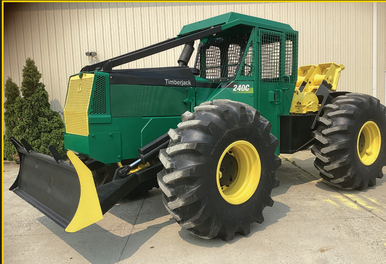
1998 240C w/ Dual Eaton winch $80,000

We continue to offer quality used parts for all makes