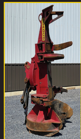
Quadco 22B Head w/ 360 Rotation off Timbco Also have boom mount for CAT/Timberking Call for Price