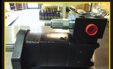
Grapple Rotate motors for Deere Skidders Series G thru H

Direct Fit no adaptors or fittings needed Proven Design, sold over 1200 Units Unlike OEM Pump, this is completely rebuildable. The parts are available at most hydraulic distributors