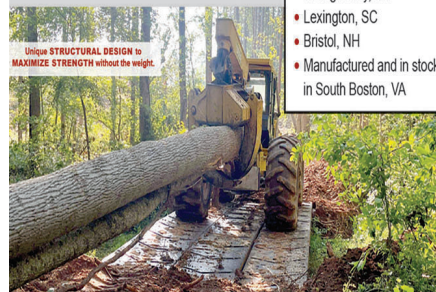
Unique STRUCTURAL DESIGN to MAXIMIZE STRENGTH without the weight.