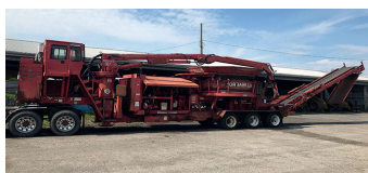
Morbark 1300 Tub Grinder CL 2006 - 6K Hours 3412 Engine