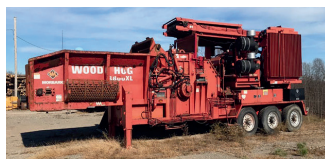
2011 Morbark 3800 XL CAT C27 Engine 5200 Hours