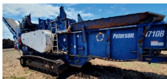
2007 4710B Track Grinder Completely Rebuilt