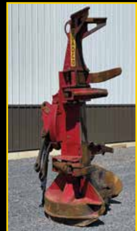
Quadco 22B Head w/ 360 Rotation off Timbco Also have boom mount for CAT/Timberking Call for Price

We continue to offer quality used parts for all makes