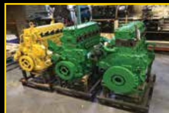
Rebuilt Long Blocks for Deere Skidders Tier 2, 3 and 4

OUR MOTTO IS SIMPLE: Treat Others Like We Would Want To Be Treated