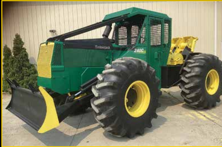
1998 240C w/ Dual Eaton winch. 5500 hrs. Never pulled wood 1st 5000 hrs. Very Clean & Straight. $69,000