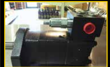
Grapple Rotate motors for Deere Skidders Series G thru H

Direct Fit no adaptors or fittings needed Proven Design, sold over 1200 Units Unlike OEM Pump, this is completely rebuildable. The parts are available at most hydraulic distributors