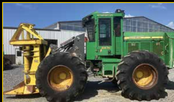
JD 843K w/ FD55 sawhead $45,000

BARKO: 160A, 160B, 1600, 275B, 350. CAT: 508, 515, 518, 525, 525B, 525C, 545, 711. CASE: 300C. CLARK: C67, 665D, 666D. FABTEK: 153. FRANKLIN: 100, 105, 130, 132, 142, 160B, 170, 405, 462, Q80. HUSKY: 335. HYDRO-AX: 221, 411, 611E, 711E. IH: S7, S8. SKIDMASTER: SK80. JD: 435, 437C, 440A, 440B, 440C, 540A, 540B, 548D, 548E, 548G, 548GII, 634K, 640, 643D, 648D, 640E, 648E, 648G, 648GII, 648GIII, 648H, 653E, 748E, 748G, 748H, 753J, 843K, 848G. PEERLESS: 2170. PRENTICE: 120, 150, 180, 210B, 210C, 210E, 280, 310E, 325, 384, 410D. T.J.: 208, 230, 230D, 240, 240D, 240A, 330, 380, 450, 360, 460, 560, 660, 660D, 608S, 850, 1270 Harvester. TIGERCAT: 610, 630B. TIMBERKING: 540, 722. TIMBERPRO: 725B. TIMBCO: 2518, 425B, 425C, 425D, 7435, 445D, 425EXL Bar Saw Head. TREEFARMER: C4, C5C, C5D, C6C, C6D, C7D, C7F, Bell Ultra T & Bell Super T, MORBARK Wolverine, Rolly Processing Head: TJ 762B Head.