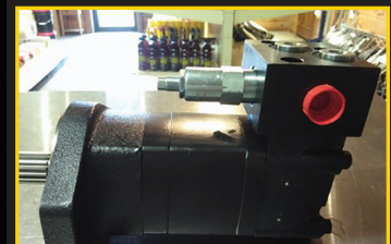
Grapple Rotate motors for Deere Skidders Series G thru H

Direct Fit no adaptors or fittings needed Proven Design, sold over 1200 Units Unlike OEM Pump, this is completely rebuildable. The parts are available at most hydraulic distributors