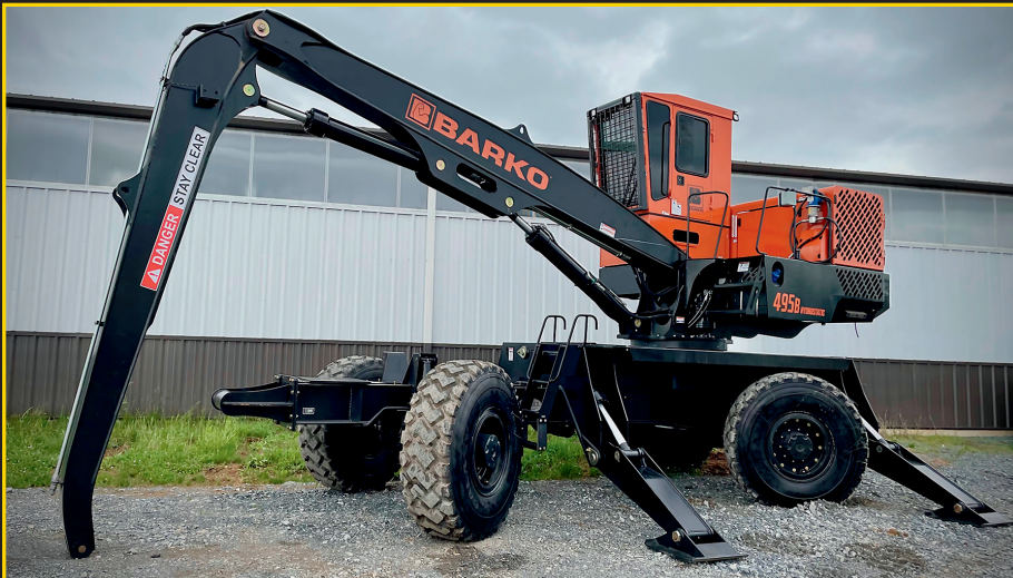
NEW BARKO 495RTC IN STOCK! THE ULTIMATE MILL YARD LOADER

We continue to offer quality used parts for all makes