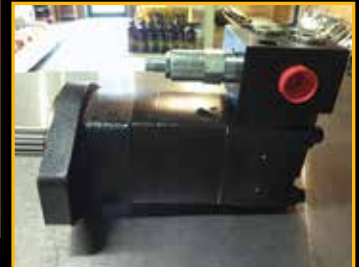
Grapple Rotate motors for Deere Skidders Series G thru H

Direct Fit no adaptors or fittings needed Proven Design, sold over 1200 Units Unlike OEM Pump, this is completely rebuildable. The parts are available at most hydraulic distributors