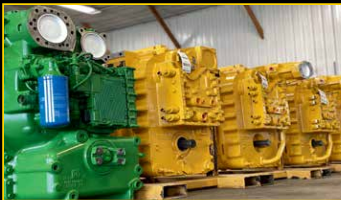
Recon Transmission in stock for GII thru L

BARKO: 160A, 160B, 160D, 275B, 350. CAT: 508, 515, 518, 525, 525B, 525C, 545, 711. CASE: 300C. CLARK: G67, 665D, 666D. FABTEK: 153. FRANKLIN: 100, 105, 130, 132, 142, 160B, 170, 405, 462, Q80. HUSKY: 335. HYDRO-AX: 221, 411, 611E, 711E. IH: S7, S8. SKIDMASTER: SK80. JD: 435, 437C, 440A, 440B, 440C, 540A, 540B, 548D, 548E, 548G, 548GIII, 634K, 640, 643D, 648D, 640E, 648E, 648G, 648GII, 648GIII, 648H, 653E, 748E, 748G, 748H, 753J, 843K, 848G. PEERLESS: 2170. PRENTICE: 120, 150, 180, 210B, 210C, 210E, 280, 310E, 325, 384, 410D. TJ: 208, 230, 230D, 240, 240D, 240A, 330, 380, 450, 360, 460, 560, 660, 660D, 608S, 850, 1270 Harvester. TIGERCAT: 610, 630B. TIMBERKING: 540, 722. TIMBERPRO: 725B. TIMBCO: 2518, 425B, 425C, 425D, 7435, 445D, 425EXL Bar Saw Head. TREEFARMER: C4, C5C, C5D, C6C, C6D, C7D, C7F, Bell Ultra T & Bell Super T. MORBARK Wolverine, Rolly Processing Head: TJ 762B Head.